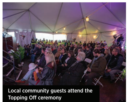
Local community guests attend the Topping Off ceremony

Situated in the North Sacramento Valley, the property will offer the latest in live music and entertainment, hospitality, world-class gaming and exceptional cuisine. It will feature a hotel with multiple suite offerings, a large gaming facility with over 1,800 slot machines and table game positions, along with an outdoor pool and deck area, large meeting space and a great selection of bars and restaurants. The property also includes signature brand amenities like the Rock Shop® and Body Rock® fitness center. Hard Rock Hotel & Casino Sacramento at Fire Mountain is expected to create more than 2,000 construction jobs upon its completion, with nearly 750 working at peak times on the project any given day. The development includes approximately 1,500 tons of steel (1/10th the weight of the Brooklyn Bridge steel), 15,000 cubic yards of concrete (if paved, would stretch to downtown Sacramento), 550 tons of rebar steel (laid from end to end, would stretch to San Francisco), 120 miles of electrical conduit, as well as 380 miles of wire and cabling (would stretch from Sacramento to Los Angeles) being used for the project. Upon opening later this year, the hotel-casino will employ over 1,000 full-time and part-time team members. For more information, visit hardrockhotelsacramento.com .