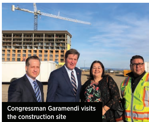
Congressman Garamendi visits the construction site